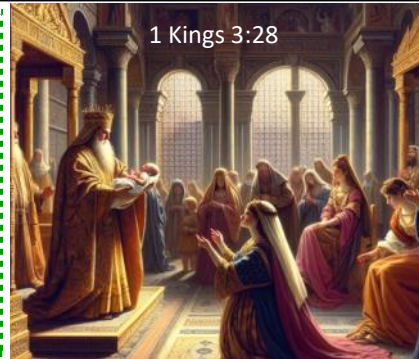
1 Kings 3:28

Central Bapt, JC Cherokee, J'boro Muddy Creek Roan Park Shallow Ford Sulphur Springs Tennessee Avenue University Parkway