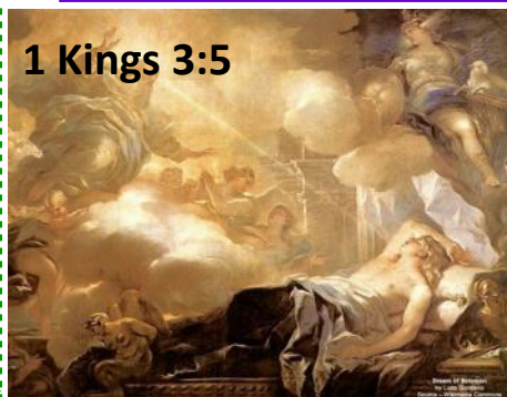
1 Kings 3:5

HBA Churches Without Pastors Central Bapt, JC Cherokee, J'boro Muddy Creek Roan Park Shallow Ford Southwestern Sulphur Springs Tennessee Avenue