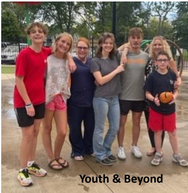
Youth & Beyond

TBMB Golden Offering Our October Goal is $500 To Date: $25