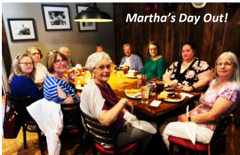
Martha's Day Out!