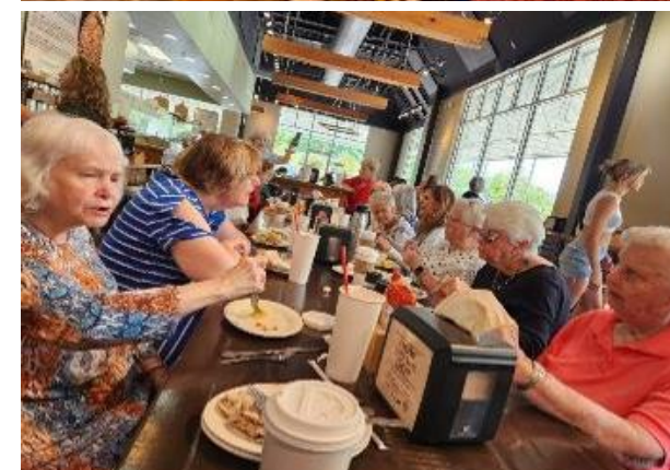
Martha's Day Out @ Kick Back Jack's