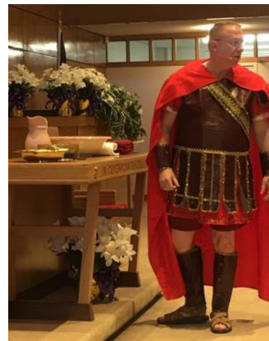
Bottom, left to right - the red towel symbolizing the shed blood of Christ he carried before belief in Jesus; the white towel symbolizes his sins washed away because of his belief in Jesus.