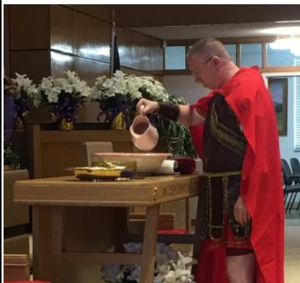
Top, left to right - Pontius Pilate washing his hands of the death of Jesus; Pilate speaks to the crowd