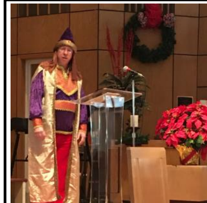
Ezra, the Innkeeper