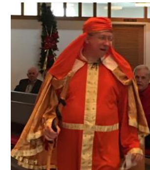
Melchior, a Magus from the Magi