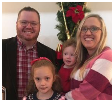
New members - the Adams Family!